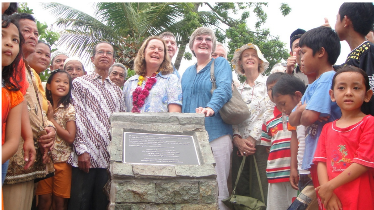
(The plaque to the women and children in the village where the camp was situated.)

From here we proceeded to the village which was the site of the former women's and children's camp. 20 families now live here and they came to greet us at the tiled plinth which was to hold the plaque. The Regent spoke to them, saying that all our families had been in Muntok at the same time and thus we are all one family now. He asked the people to take good care of the plaque for us.