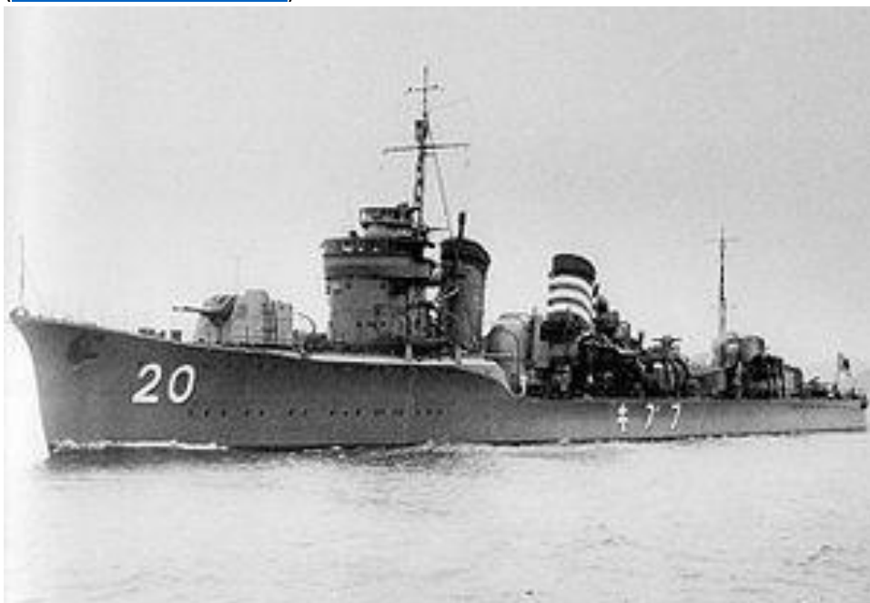
Imperial Japanese Navy Destroyer 'Fubuki'