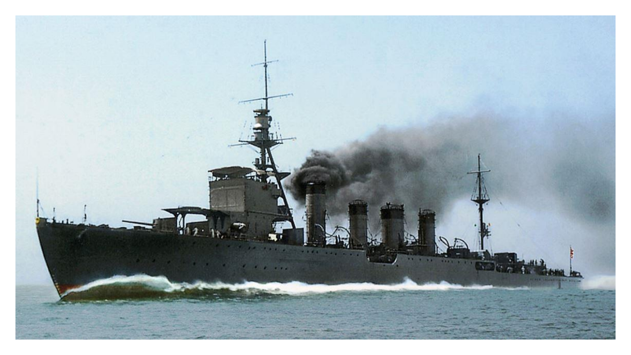
IJN Light Cruiser 'Sendai'

The 'HMS Yin Ping' had come up against the powerful warships (the 'Yura', 'Sendai', 'Asagiri' and 'Fubuki') providing protection for the huge invasion fleet carrying the Japanese Army heading for Palembang in southern Sumatra and — specifically the cruiser they encountered was the huge First World War Japanese cruiser 'Sendai' — identified in 2020 by the fact that it had four funnels by LAC Shephard, a survivor from the 'HMS Yin Ping' still living in the UK in 2020. The cruiser was 418 feet in length, 5200 tons, had a speed of 35 knots and carried seven turrets of 5 .5-inch guns.