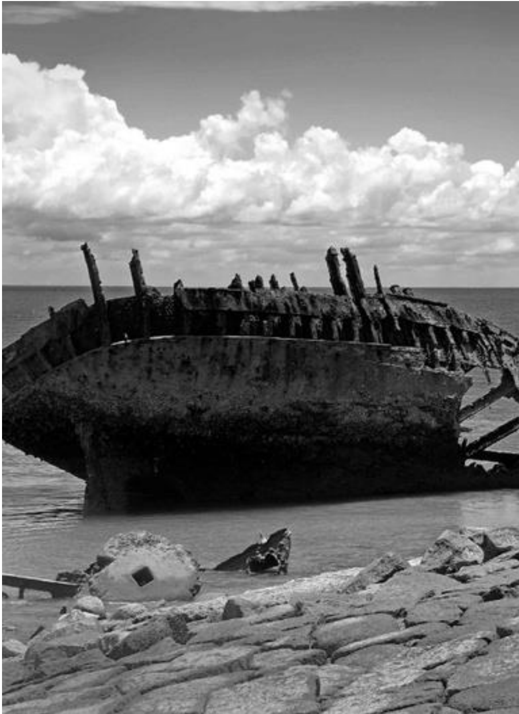
A photo taken at an unknown location on Banka Island – it is possibly the ‘HMS Fuh Wo’ and may be located just north of the stone block construction Tanjong Kalian / Muntok lighthouse. See the next illustration map drawn by Allied Search parties in late 1945 looking for evidence of war crimes committed at Radji Beach.