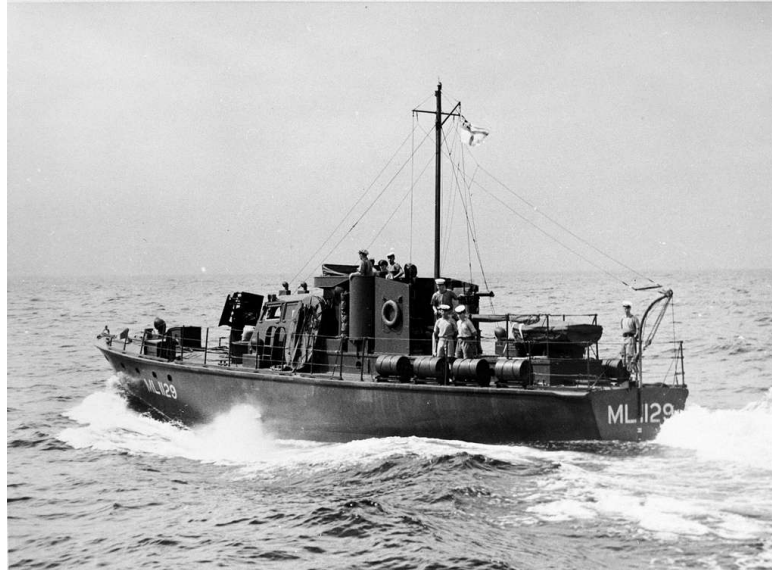
A Harbour Defence Motor Launch of the same design as HDML 1062

HDML 1062 was one of two (the other was HDML 1063) Fairmile Harbour Defence Motor Launches built in Singapore and completed for the Straits Settlement RNVR. Others, with batch numbers up to 1220, had been planned or construction started, but wartime events and the invasion of Singapore meant they were not completed - and some never started. In fact, post War in 1946 the 'Straits Times' newspaper had an advertisement for the sale of HDML1086 "... in bad condition... " at Thornycroft, Tanjong Rhu. HDML 1086 must have languished, incomplete, in Singapore during Japanese occupation.