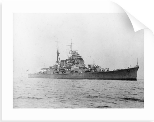
IJN Cruiser 'Chokai'

The modest sized HDML 1062, really a large launch, would have been totally shattered by the first hits from shells from a large warship like a Cruiser – if Lt Stein was correct in his identification of the specific type of warship. If a Japanese Cruiser it would have been either the flagship of the Japanese invasion fleet, the 'Chokai' and its eight-inch shells, or the 'Kashii' and its five-inch shells: -