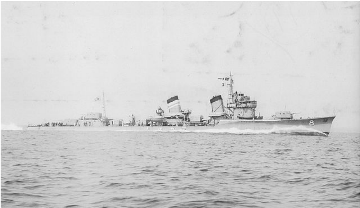
Imperial Japanese navy destroyer: ‘Asagiri’

Two Japanese destroyers approached the GB at high speed, one of them signalling in incomprehensible Morse code, and stopped within half a mile of the GB when one of them sent a launch towards the GB. It was within a hundred and fifty yards of the GB when an RAF or Dutch bomber (Anna Silberman and Gordon Reis in their diaries state there were two bombers) from Sumatra suddenly appeared and began circling overhead; the Japanese destroyers opened fire, the bomber (s) flew off, and the Japanese recalled their launch.