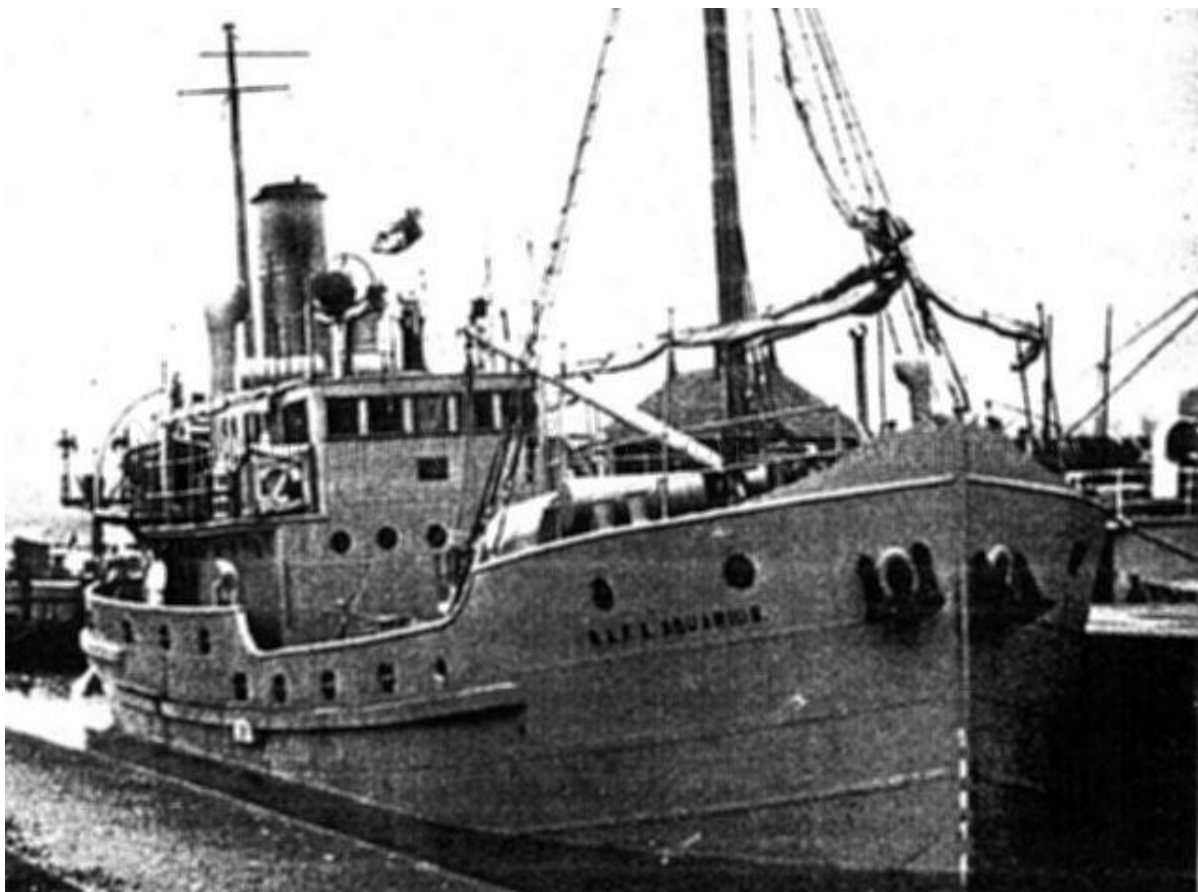
Photo: Royal Air Force Auxiliary 'Aquarius'