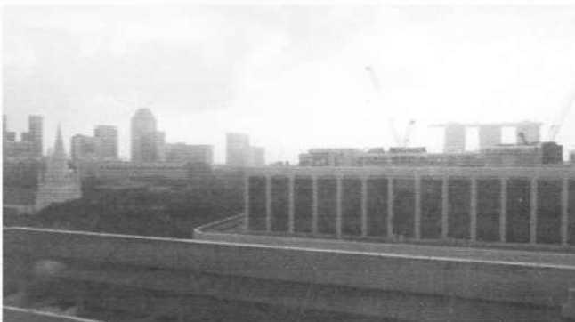
View from our hotel room at dawn, with the white spire of St Andrew's Cathedral at left, and the Marina Bay Sands Hotel – with its Skypark viewing platform – at right.

Next day was Sunday, and it was a short walk to St Andrew's Cathedral for the main English language service at 8 am.