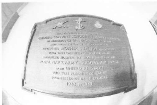
THIS PLAQUE IS PRESENTED TO THE CHARITAS CONVENT SCHOOL PALEMBANG SUMATRA IN REMEMBRANCE OF AND GRATITUDE FOR THE HELP AND ASSISTANCE RENDERED BY THE REVEREND MOTHER SUPERIOR AND SISTERS WHEN THEY OPERATED THE SCHOOL AS AN IMPROVED HOSPITAL TO THOSE MEMBERS OF THE ROYAL NAVY, ARMY, AND ROYAL AIR FORCE OF THE UNITED KINGDOM WHO WERE PRISONERS OF WAR IN JAPANESE HANDS IN THE HOSPITAL 1942 TO 1943

The story behind the plaque is that during the War the nuns tended the most seriously ill from the Men's and the Women's Camps, until the hospital was closed and they too were interned. It was good to see that the British military had already demonstrated their gratitude for these services by presenting their own plaque, on display in the old main entrance.