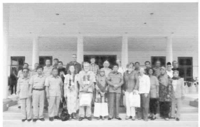
We were all given bags containing a silk shirt and 2 T-Shirts.