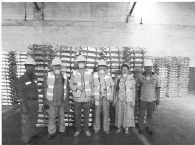
Tin Futures on the World's markets, probably worth an interminable number of Indonesian Rupiahs (£1 = IDR 14,863.22 at the time of writing), with some ingots in the background.

On Friday we had to return to Palembang by ferry, for another night in our hotel, before flying to Heathrow via Singapore on Saturday. We had one more experience to fit in on our way to the ferry, and that was a quick visit to the Tin Mine, part of the nationalised tin producing industry. We really only had time to see the shed where the ingredients – various grades of dredged and mined sand – are mixed, the shed where the cast ingots are weighed and bundled into equal-weighted pallets (see below), and the display room full of samples of each stage of the process. If you have ever done any tin soldering, the chances are that the solder came from Muntok, as it is the World's largest tin producer. Mr Rizki and his staff are proud of their factory and its product, but I'm glad I don't have to work in that heat, especially with hard hats and masks.