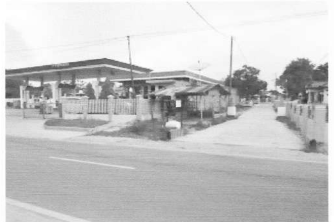
The site of the Cemetery now. The lane (shown right) separated 4 equal-sized areas, 2 on either side. The Women were buried in the front left area, where the Pertamina petrol station is, and the Men in the area behind, now occupied by houses.