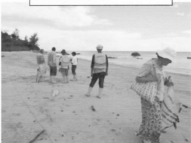
Tropical beachwear, courtesy of the Timah Tin Company.

In the afternoon we discovered that 2 high-speed canoes had been laid on to take us to Radji Beach where the Australian Army nurses were massacred. It was a lovely calm day, neither too hot nor bright, and we were dropped off to walk for about ½ a mile along beautiful beaches separated by low rocky headlands. In spite of the beauty and the company, it was hard not to recall what had happened here 70 years ago. Shelagh's party would have landed on a similar beach, but possibly even further along the coast.