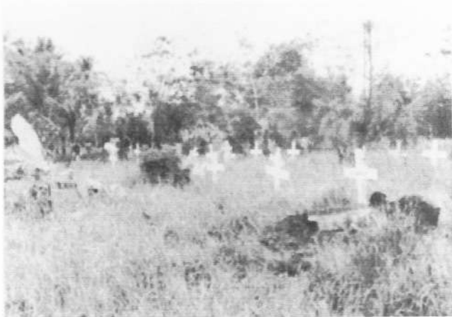
Photograph of part of the Dutch Cemetery in Muntok, taken an unknown number of years ago.