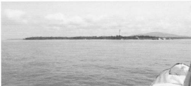
Approaching Muntok. The current pier is to the right of the lighthouse, with the old pier and town c 2 miles further on. The survivors of the various shipwrecks landed all along the coast to the left (North) – Radji Beach is c 5 miles in that direction.

We were also very conscious, crossing those waters, of the devastation wreaked there 70 years earlier on 22 of the ships fleeing Singapore. So we approached the prominent lighthouse of Muntok in a subdued frame of mind, quite unlike that of any of the many landfalls we have made in the past.