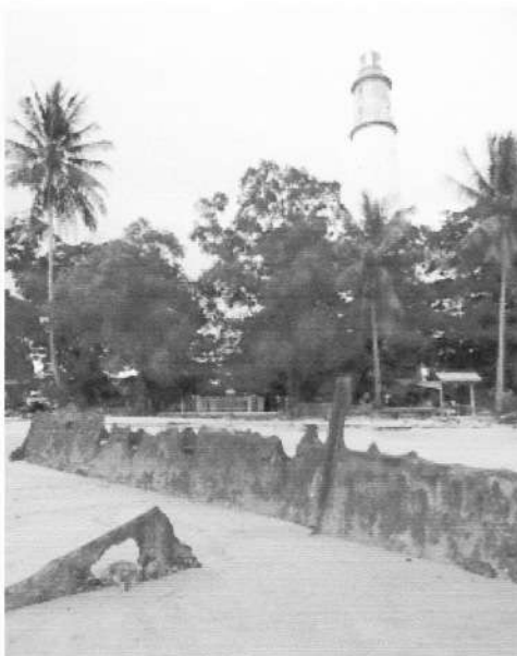
One of a number of wrecks on the beach, with the Australian Army Nurse's Memorial under the trees to the left of Muntok Lighthouse