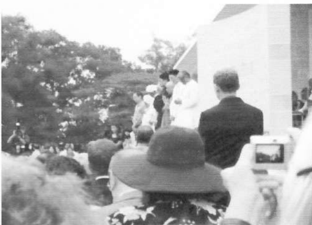
Inter-Faith Silent Prayer at Kranji

The Remembrance Ceremony was organised by the Changi Museum and the National Archives of Singapore, and consisted of a number of readings, songs from an excellent boys' choir, the laying of many wreaths, and two very moving minutes of silent prayer by representatives of at least 8 religions standing side-by-side. Lord Green, a Trade Minister, laid a wreath on behalf of the UK government, and other countries sent their ambassadors or lesser dignitaries for the same purpose. Then the veterans' groups, including the MVG, laid their wreaths, the Australians outnumbering all the others.