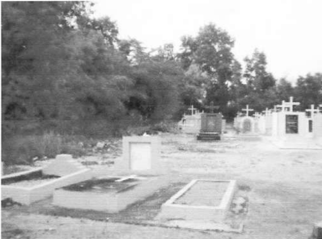
The grave (centre front) in the RC Cemetery with an inscription stating that (in Indonesian): 'Here rest 25 English Allied Military .... Reburied at Muntok Catholic Cemetery 19 March 1981' It appears that this inscription must be incorrect, and that the remains are those of British civilian women – but which?

But are they there now? During the construction of the petrol station 30 years ago human remains were found, and were reburied communally in the Catholic Cemetery.