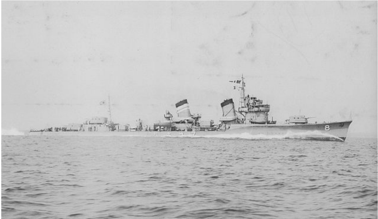
Imperial Japanese navy destroyer: 'Asagiri'

Further research involving the logs and naval records of Japanese destroyers has confirmed to a high degree of accuracy that the Japanese warships were in fact two "Fubuki" class destroyers – these were extremely heavily armed and effective warships. They each carried six 5inch guns and another 32 antiaircraft and mounted machine guns, plus nine torpedoes and were capable of making 38 knots. The specific destroyers were the "Fubuki" and the "Asagiri" which were involved in many of the sinkings of British and Dutch ships in the Indonesian Archipelago and the Banka Straits during this terrible one week period.