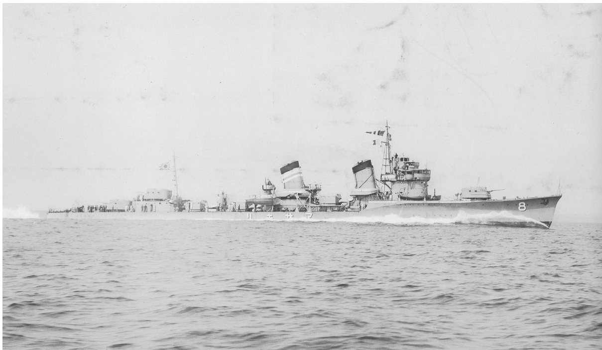
Japanese destroyer 'Asagiri'

The attacking Japanese warships could have been cruisers or destroyers. The destroyers 'Fubuki' and 'Asagiri' were known to have been sinking ships near the location of the 'HMS Yin Ping'. It was an unequal contest in the extreme and the unarmed 'HMS Yin Ping' was easy prey for the sophisticated and very heavily armed Japanese warships, which were world class insofar as speed and armaments and in fact superior to Allied warships in the region at that stage of the War.